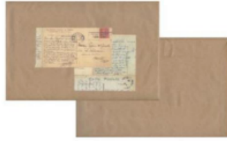
Example of portfolio case: front and back image of a large envelope.